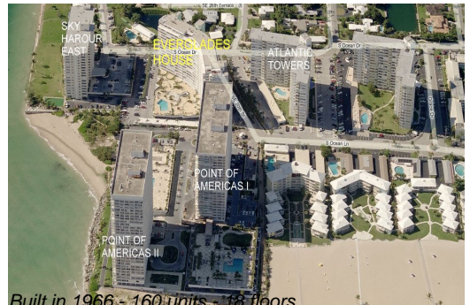
Built in 1966 - 160 units - 18 floors