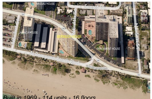
Built in 1969 - 114 units - 16 floors