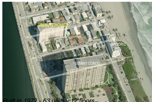
Built in 1972 - 63 units - 12 floors