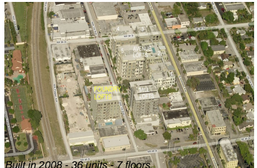
Built in 2008 - 36 units - 7 floors