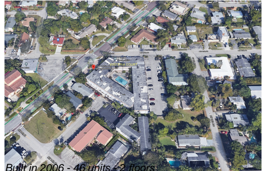
Built in 2006 - 46 units - 2 floors