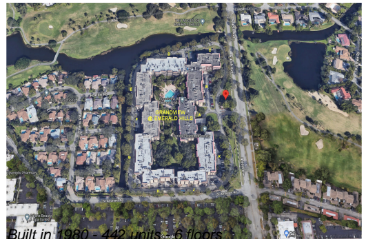
Built in 1980 - 442 units, 6 floors