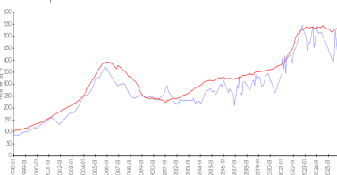
Southpoint South vs Fort Lauderdale