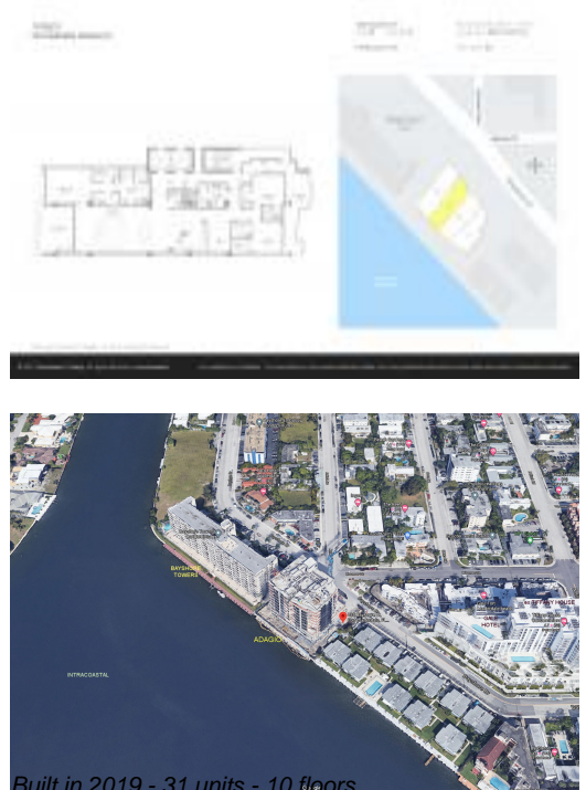
Built in 2019 - 31 units - 10 floors

Adagio Fort Lauderdale Beach 13% Fort Lauderdale 4% Broward 4%