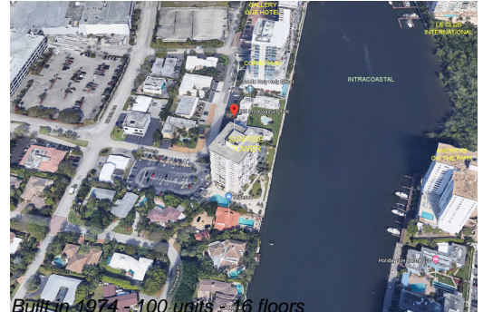
Built in 1974 - 100 units - 16 floors