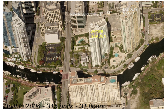
Built in 2004 - 315 units - 31 floors

The above valuated price is a baseline figure that does not take into account any specific renovation, upgrade, split, merge, or deterioration of the unit.