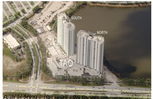
Built in 2009 - 198 units - 26 floors