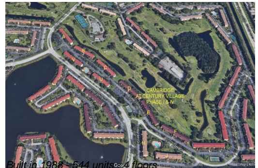
Built in 1988 - 544 units - 4 floors