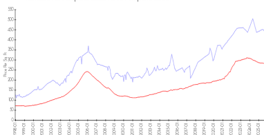
Renaissance Pompano Beach 2 vs Pompano Beach