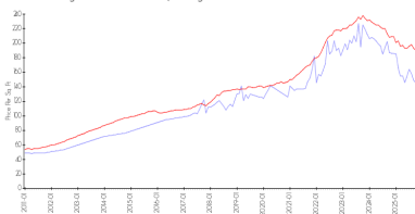
Buckingham East at Century Village vs Pembroke Pines