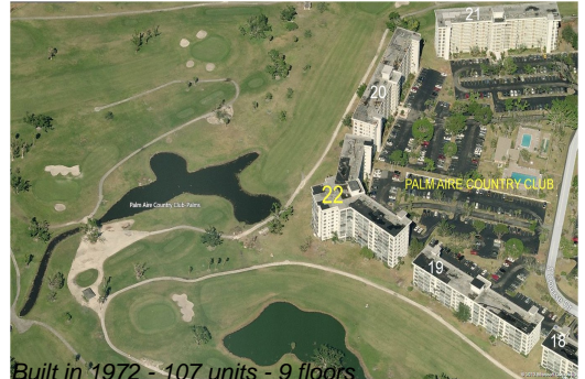
Built in 1972 - 107 units - 9 floors