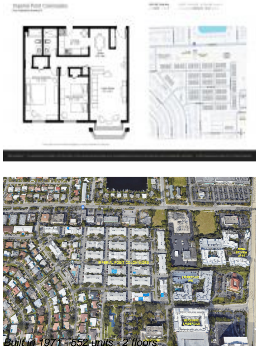
Built in 1971 - 552 units - 2 floors