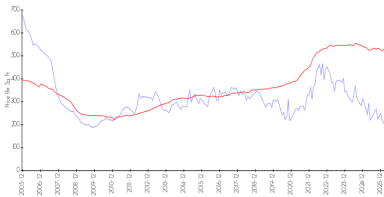
Gallery One vs Fort Lauderdale