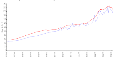
Buckingham East at Century Village vs Pembroke Pines