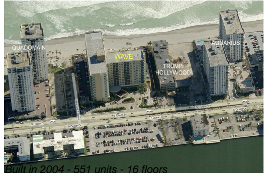
Built in 2004 - 551 units - 16 floors