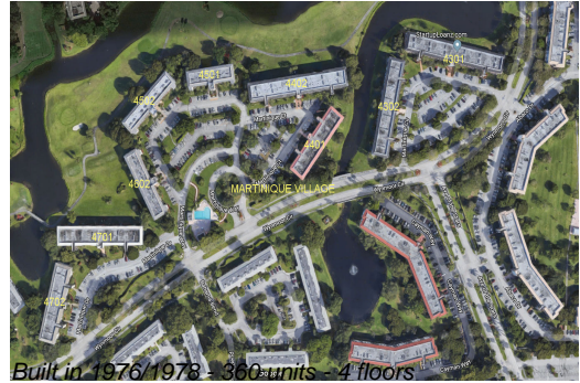
Built in 1976/1978 - 360 units - 4 floors