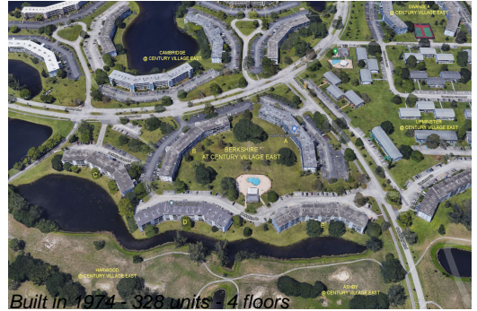
Built in 1974 - 328 units - 4 floors