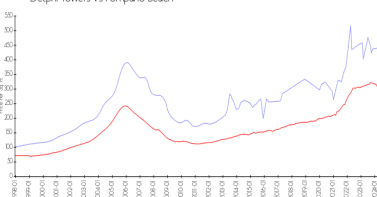
Delphi Towers vs Pompano Beach