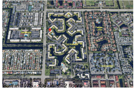
Built in 1975 - 108 units - 2 floors