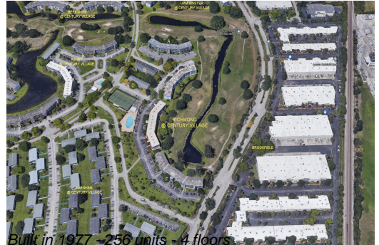
Built in 1977 - 256 units - 4 floors