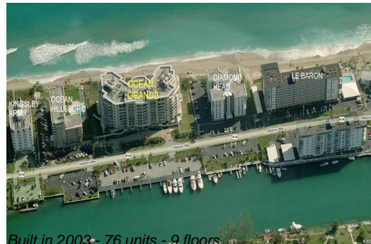
Built in 2003 - 76 units - 9 floors