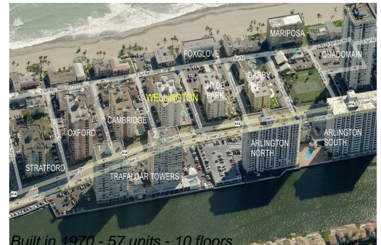
Built in 1970 - 57 units - 10 floors