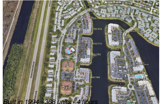
Built in 1994 - 368 units - 4 floors