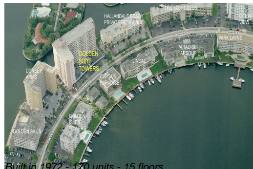
Built in 1972 - 170 units - 15 floors