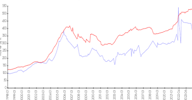
Lauderdale by the Sea vs Broward