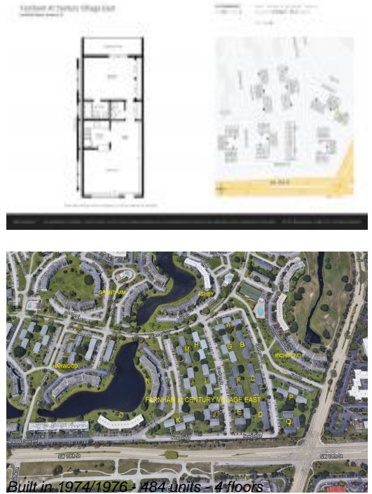
Built in 1974/1976 - 484 units - 4 floors