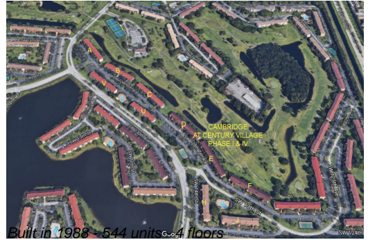
Built in 1988 - 544 units, 6-24 floors