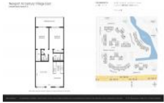
Built in 1974/1978 - 796 units - 2 floors

The above valuated price is a baseline figure that does not take into account any specific renovation, upgrade, split, merge, or deterioration of the unit.