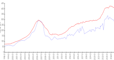
Allington Tower North vs Hollywood Beach