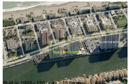
Built in 1969 - 120 units - 16 floors