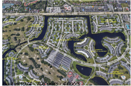
Built in 1974 - 708 units - 4 floors