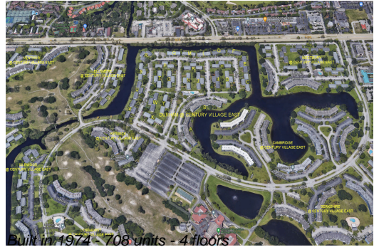
Built in 1974 - 708 units - 4 floors