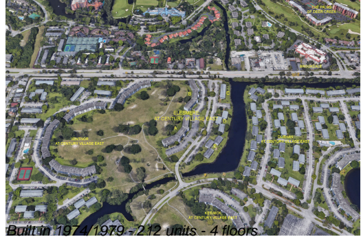
Built in 1974/1979 - 212 units - 4 floors