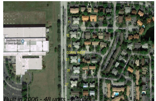
Built in 2006 - 48 units - 2 Garages