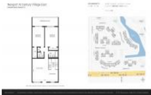
Built in 1974/1978 - 796 units - 2 floors

The above valuated price is a baseline figure that does not take into account any specific renovation, upgrade, split, merge, or deterioration of the unit.