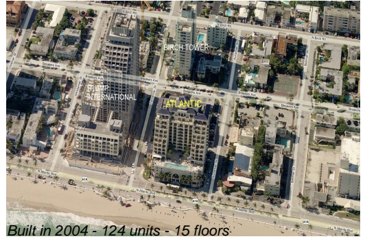
Built in 2004 - 124 units - 15 floors

The above valuated price is a baseline figure that does not take into account any specific renovation, upgrade, split, merge, or deterioration of the unit.