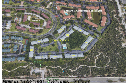
Built in 1978/1986 - 184 units - 2 floors