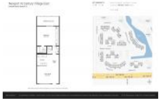
Built in 1974/1978 - 796 units - 2 floors

The above valuated price is a baseline figure that does not take into account any specific renovation, upgrade, split, merge, or deterioration of the unit.