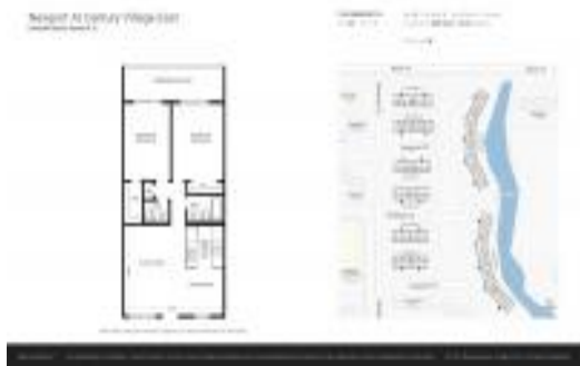
Built in 1974/1978 - 796 units - 2 floors

The above valuated price is a baseline figure that does not take into account any specific renovation, upgrade, split, merge, or deterioration of the unit.