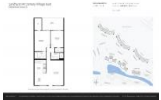
Built in 1974/1977 - 480 units - 4 floors

The above valuated price is a baseline figure that does not take into account any specific renovation, upgrade, split, merge, or deterioration of the unit.