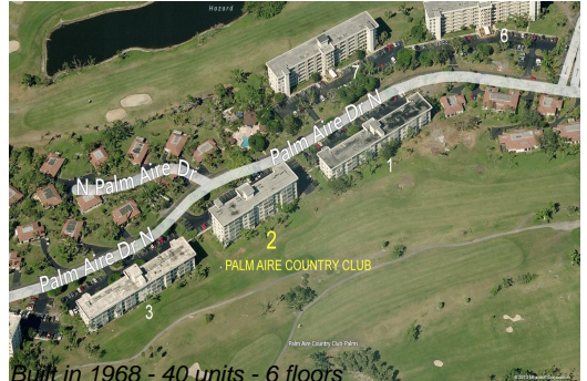
Built in 1968 - 40 units - 6 floors