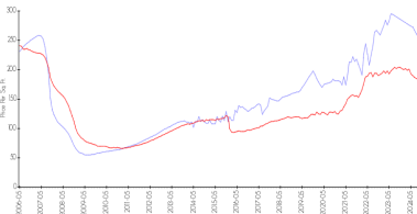
Edgewater vs Coconut Creek