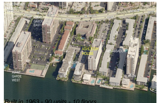
Built in 1963 - 90 units - 10 floors