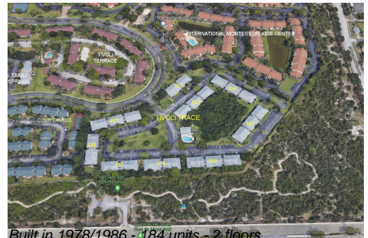
Built in 1978/1986 - 184 units - 2 floors