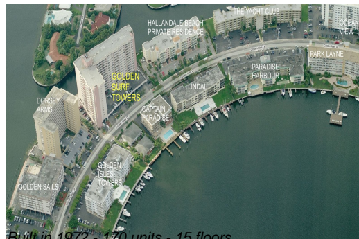
Built in 1972 - 170 units - 15 floors