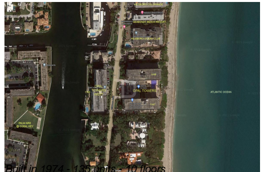
Built in 1974, 135 units, 10 floors